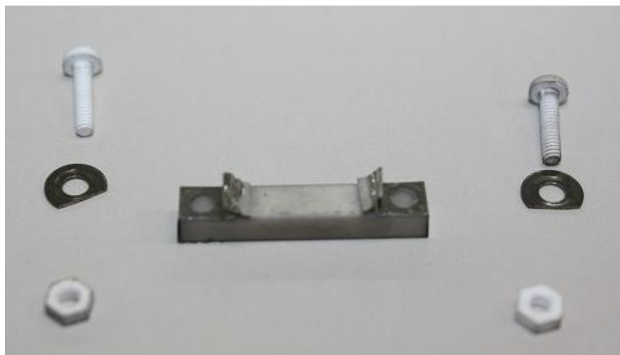
(2) Fix electrode plates to alumina substrate with screw, nut, and washer.