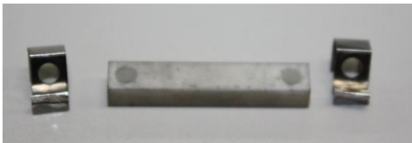
(1) Attach electrode plates to both ends of alumina substrate.