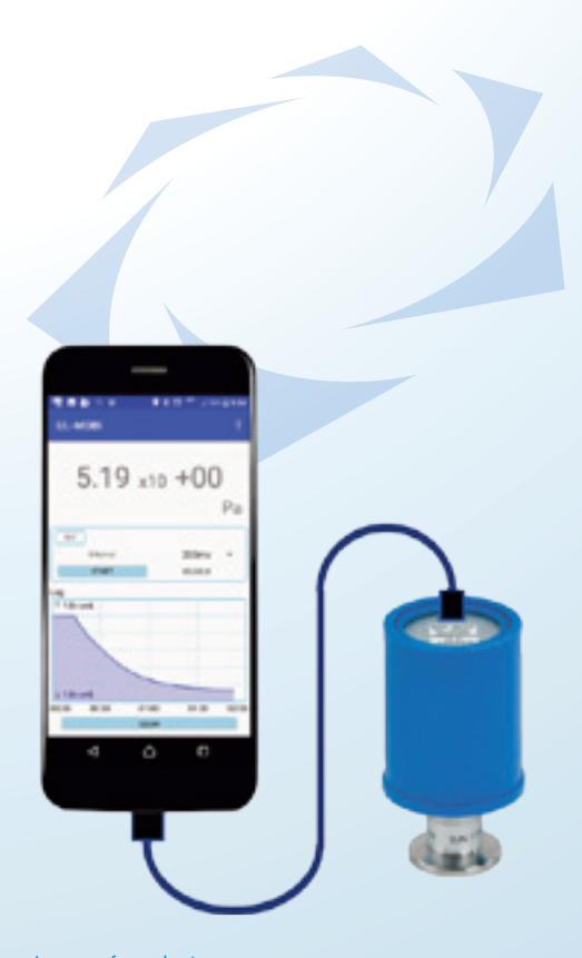
Image of product usage Note) Smartphone and USB cable are not attached.